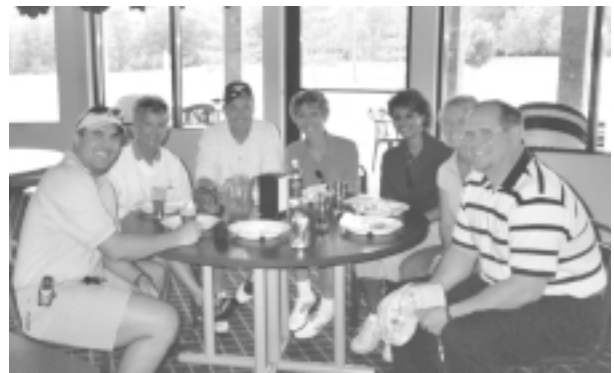
Always a strong following from Touchpoint