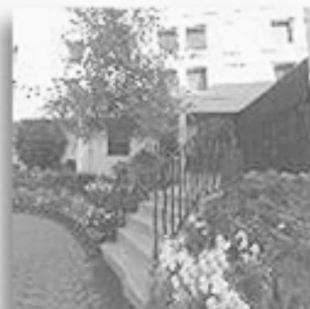
View of the hotel courtyard

Wisconsin Association of Health Underwriters Annual Fall Sales Conference September 10-12 Radisson Paper Valley Hotel Appleton