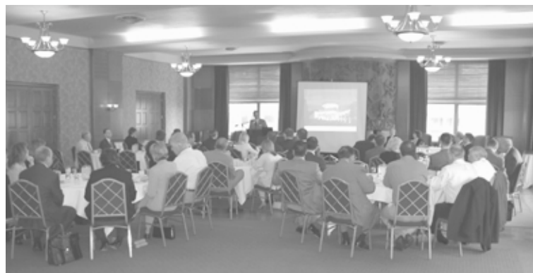
Jon Rauser greets a full house for the chapter meeting