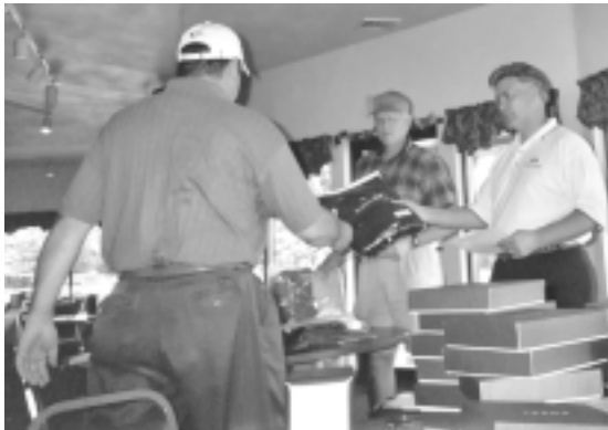
Gifts for everyone!

If there is anything that the Fox Valley Chapter can help you with, let me know.