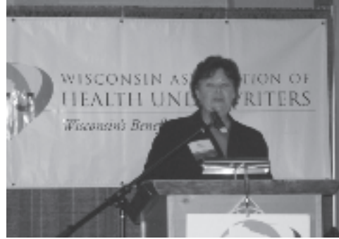
Announcing the 2009 WAHU Scholarship Program for Technical Colleges.