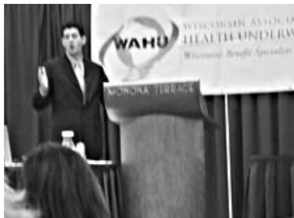
Congressman Paul Ryan speaks to the WAHU Day on the Hill attendees.