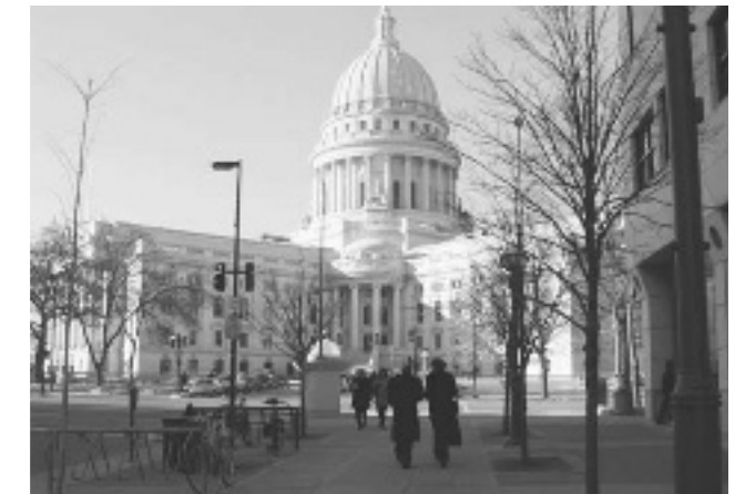
Day on the Hill attendees make their way to the Capitol.