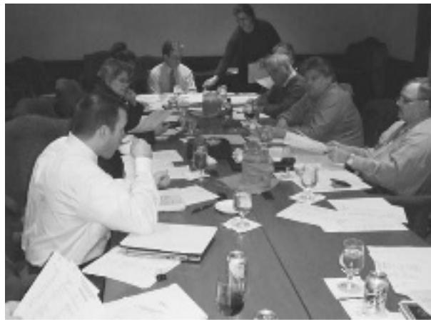
2006 WAHU Board hosts their first meeting of the year.