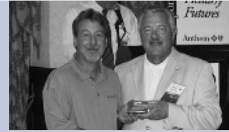
Consumers Life Insurance Company