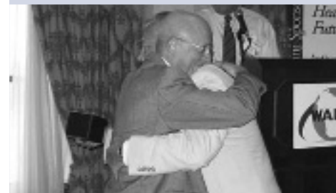
United Resource Group