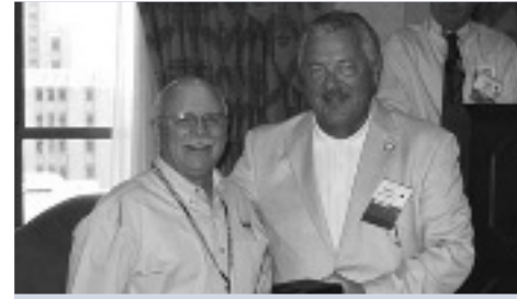
Employee Benefits Corporation