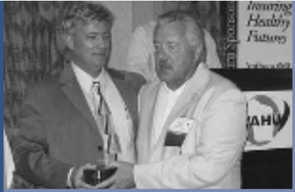
Anthem Blue Cross Blue Shield (WI)