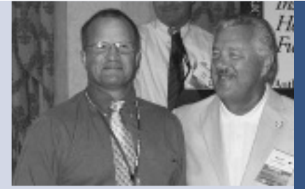
Rogers Benefit Group