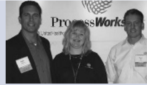
Process Works Inc.