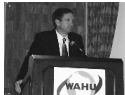
Congressman Mark Green, 2006 GOP Gubernatorial Candidate, spoke at the 2006 Annual Fall Sales Conference about his candidacy.