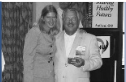
Physicians Plus Insurance Corp