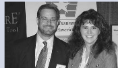
Vision Insurance Plan of America