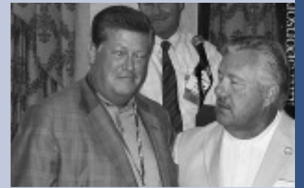
WPS Health Insurance