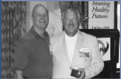
Delta Dental Plan of Wisconsin