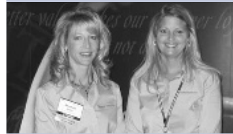
Security Health Plan of WI