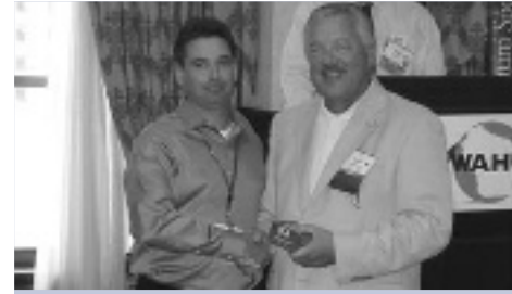
Group Health Cooperative